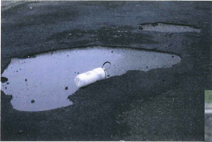
This is the high jump facility with huge holes where the jump surface is coming up. That water bottle shows the size of the holes.