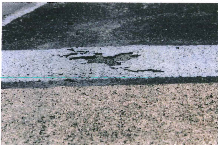
Parts of the track where the surface is coming up leaving divots. This is months away from becoming a large hole.