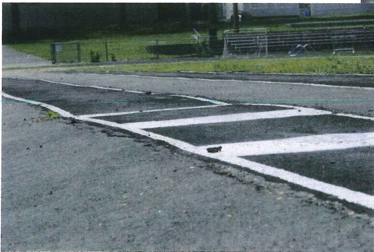
The long jump and triple jump runways showing the warping undulation from the 40 year old base, including chunks of the runway being left from athlete spikes pulling up parts of the track.