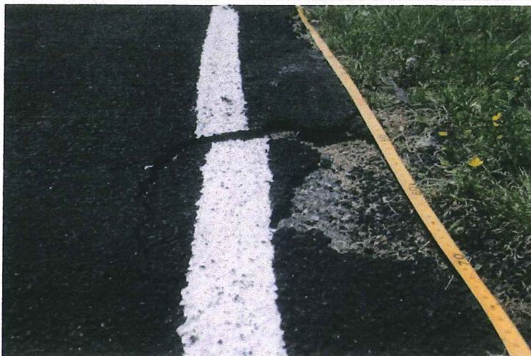
Major decay in the pole vault runway

The track where the 20 year old 400 m track is decaying into the 40 year old 440 yard track.